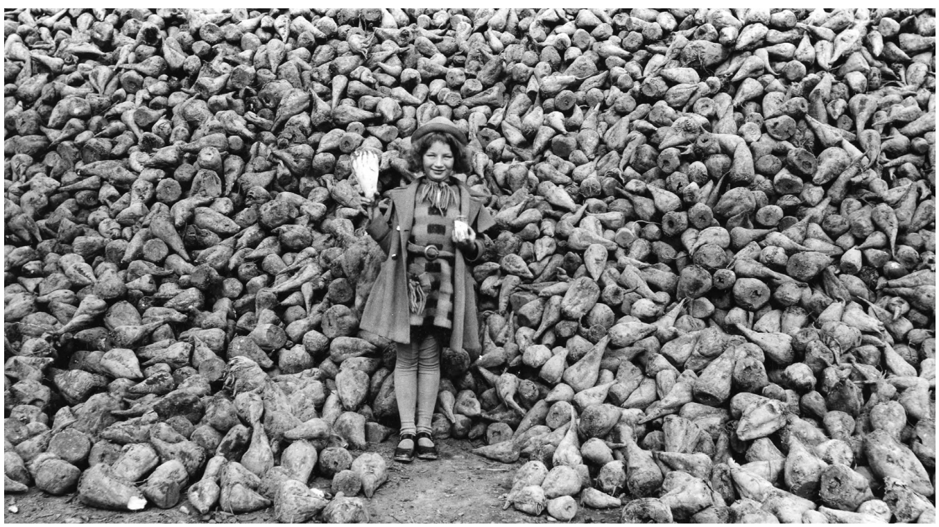
Utah girl with sugar beet harvest, (courtesy Utah State Historical Society)

Use the Observe-Question-Reflect worksheet to analyze these primary sources from Utah's past.