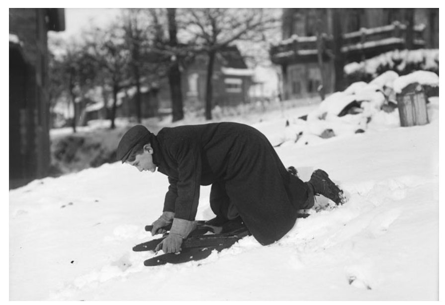
Boy with sled, Salt Lake City, 1909