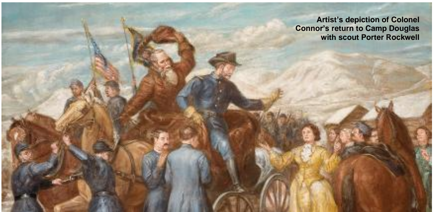
Artist's depiction of Colonel Connor's return to Camp Douglas with scout Porter Rockwell